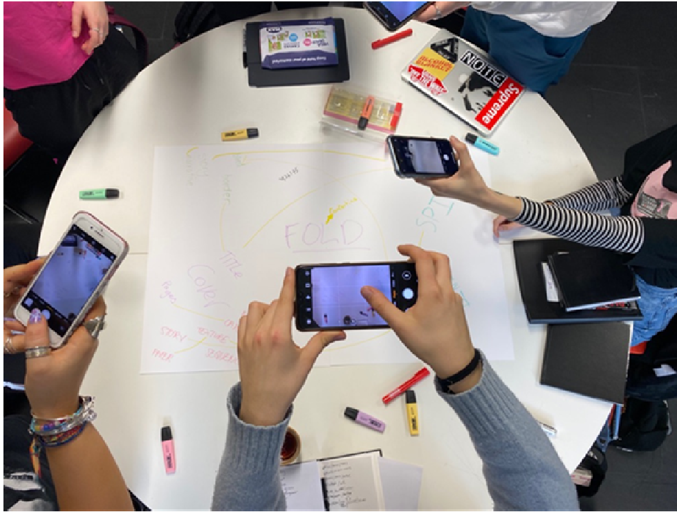
Figure 4: L5 tutor group, 2020. Students document the 'tablecloth' at the end of a tutorial