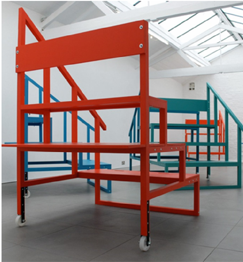
Figure 2: Spaces to Speak Revision Part II, 2010 Céline Condorelli The artist has made movable seating to facilitate a flexible public forum

Stephen Brookfield describes discussion as a ‘disciplined and focused exploration of mutual concerns’ (Brookfield, 1999) and the structured methodologies he suggests in Discussion as a Way of Teaching could be adapted well to online teaching and could allow for a more productive session. Brookfield suggests a system of ground rules, and I could see how a list of ‘rules for Zoom’ adapted from XR and my own experience and the experiences of colleagues and learners would be a useful resource. The Circle of Voices, one of Brookfield’s techniques for encouraging discussion, could offer a way of allowing each of the students a voice, and despite occupying different ‘time spaces’ would allow for a reflective period of listening.