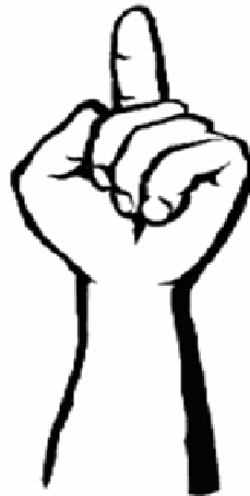
Figure 1: 'I Want to Contribute to the Discussion', a hand signal used by Extinction Rebellion as a quick way of communicating on video conferencing.

In order to prepare for online tutorials I attended a number of training events and seminars. Key to highlighting the differences between online and 'real world' group interaction was a training session I attended with Extinction Rebellion (XR) who have used Zoom as their primary online meeting tool for a long time. XR have developed hand signals to communicate as a way of getting around the audio visual latency that is inherently part of online communication. Microphones are muted (unless speaking) and a series of nine hand signals are used to show agreement, raise a point or object. The muting of microphones and use of hand signals highlighted to me that unlike a conversation in person or a phone call, when using an online platform the image is the primary form of communication. Due to the technical limitations of online communication platforms such as Zoom there is something unavoidably lost in communicating aurally, making it clear that there is a need to actively engage with the possibilities of the visual online medium in teaching, to both make up for what is lost in, and in some circumstances maybe even exceed, the rhythm of face to face communication.