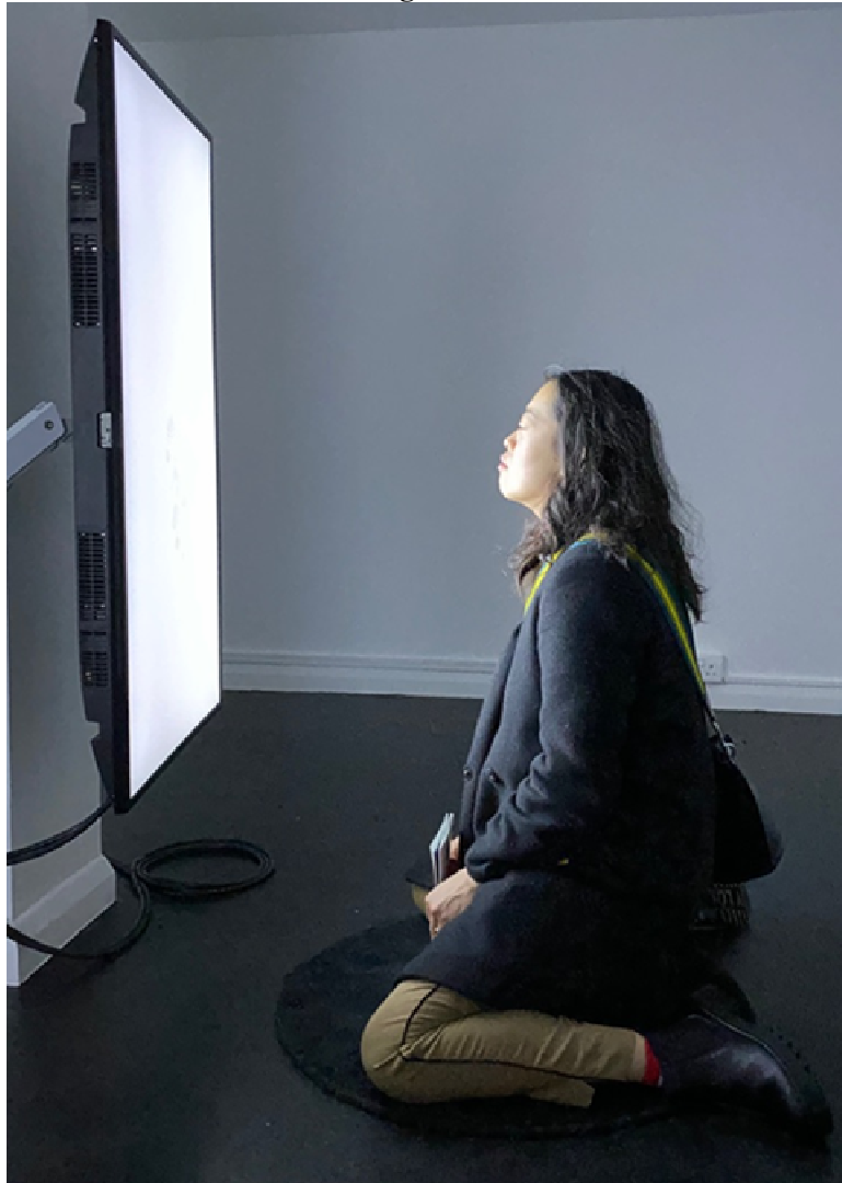
Figure 3: taken at ‘Casting Out the Self’ exhibition by Dominic Hawgood, 2020. The artist has created a work that induces mild visual hallucinations when the flickering screens are stared at.